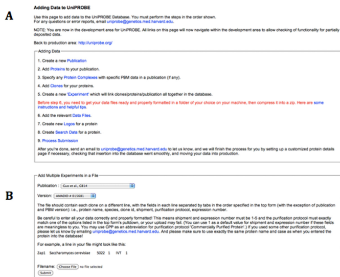
Figure 1. Data deposition pipeline. (A) The main page for the UniPROBE data deposition pipeline provides an outline of the data deposition procedure. The user successively clicks each link and follows the instructions in each step. Some steps require only the click of a button, whereas others require either submission of an input file or some extra actions on the command line. (B) The instructions for file-based input in step 5. Steps 2 and 4 have similar instructions. File-based input makes it easy for the user to simultaneously provide all the relevant information to add to the database, and has formatting, error checking and rollback functionality built in.